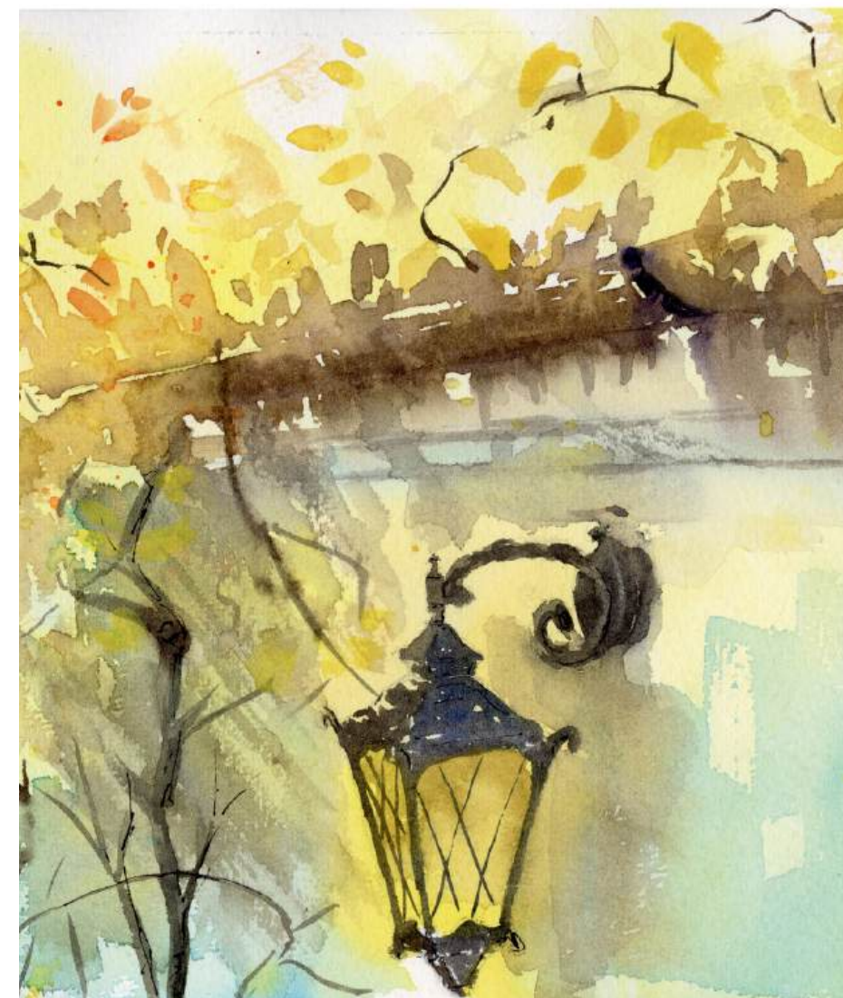
'Autumn lights', 2022 18x26 cm (watercolor on paper)