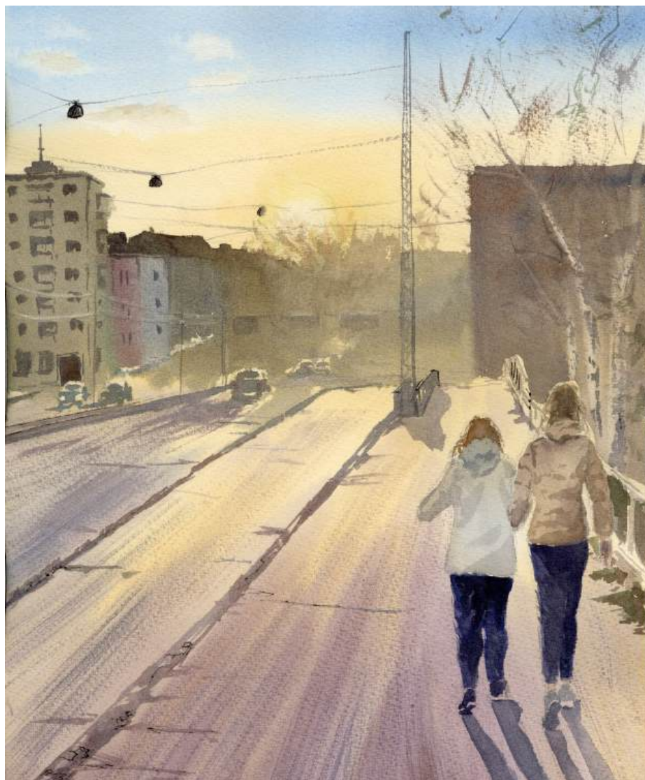
'The first touch of spring', 2023 26x36 cm (watercolor on paper)