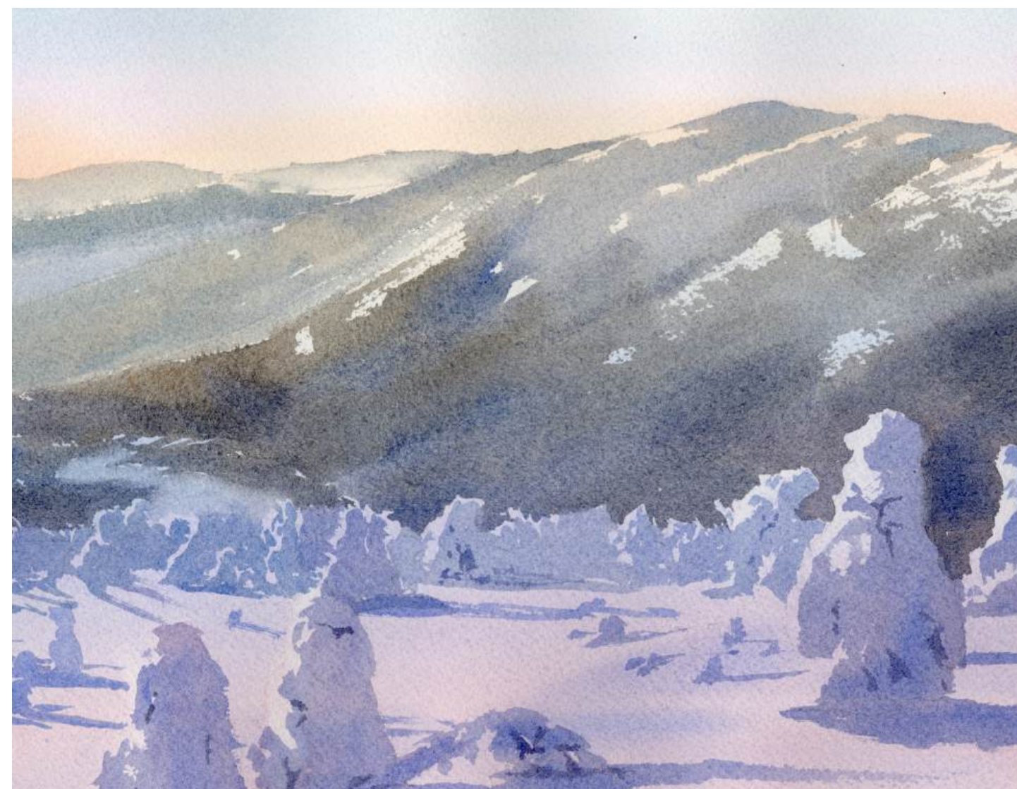
'Sunrise in Lapland', 2024 A4 (watercolor on paper)