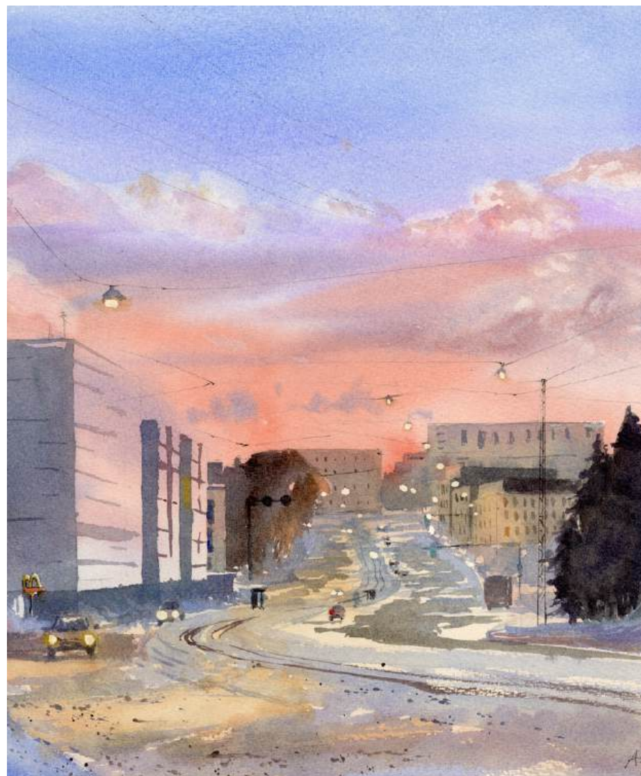
'Helsinki is waking up', 2024 26x30 cm (watercolor on paper)