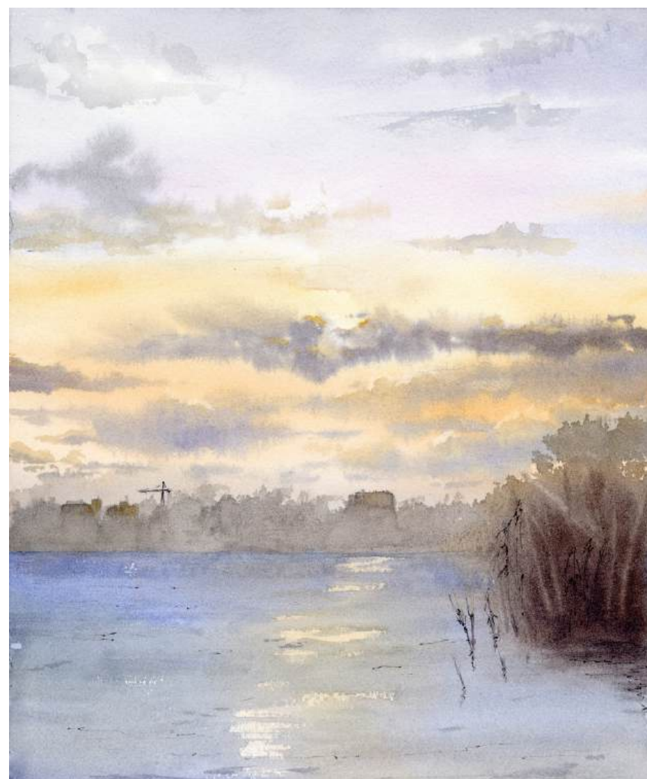
'Good times', 2023 24x32 cm (watercolor on paper)