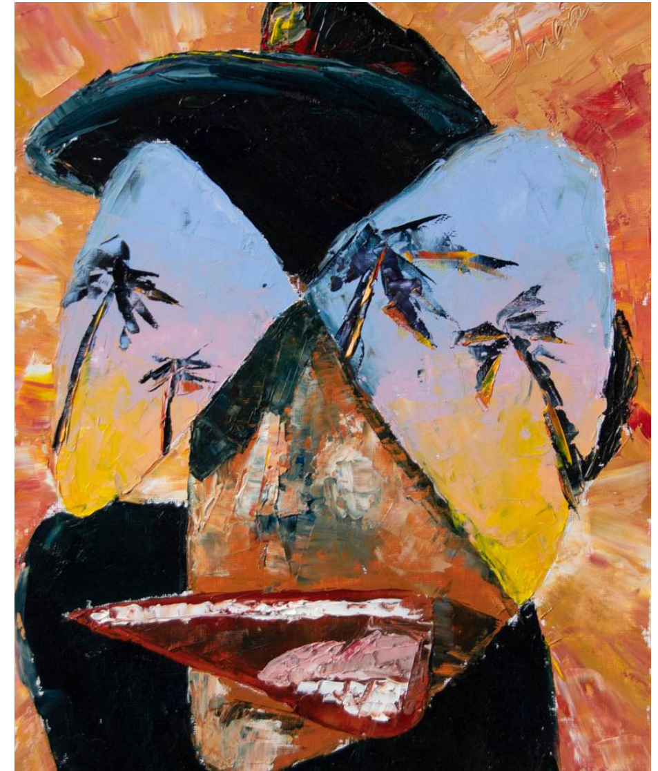
'Whaaaat?!', 2023 A3 (oil on canvas-like paper)