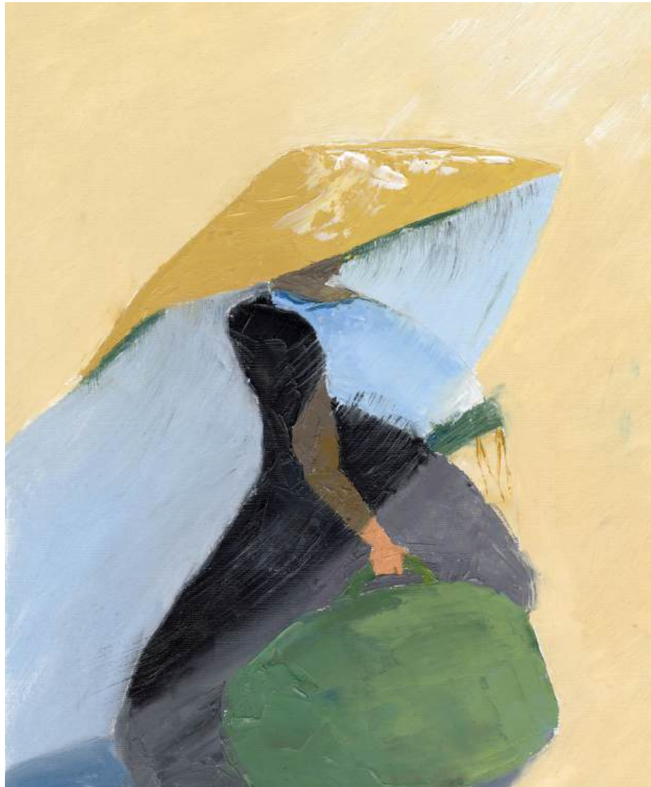
'Who is the boss? I am the boss!', 2023 A3 (oil on canvas-like paper)