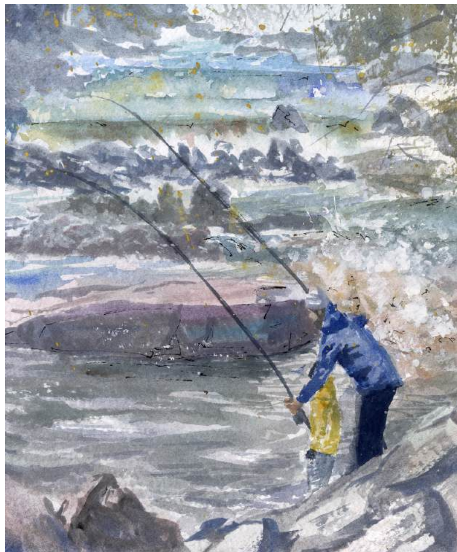
'Fishing lesson', 2022 23x20 cm (watercolor on paper)