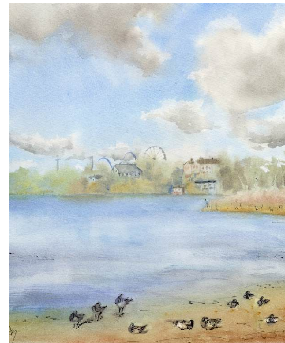
'Pitstop before the flight', 2023 26x36 cm (watercolor on paper)