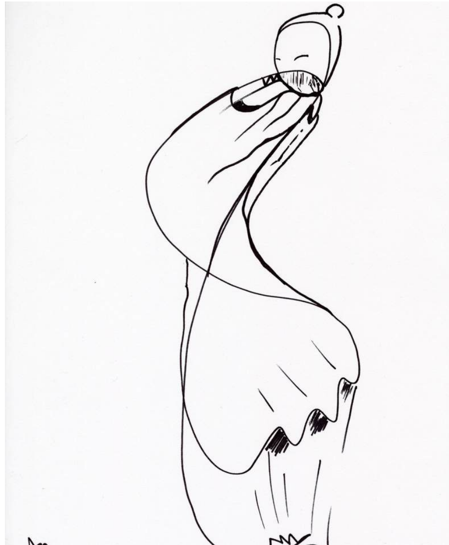
'Geisha', 2024 A4 (marker on paper)