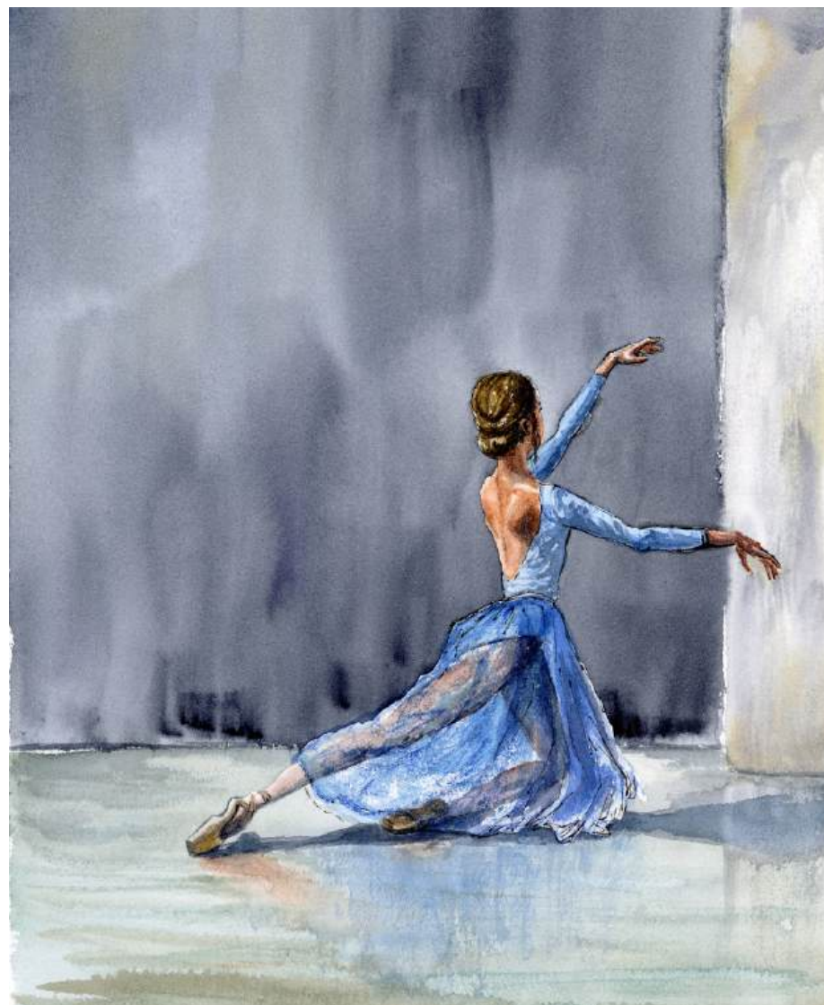
'Ballerina in a blue dress', 2022 24x32 cm (watercolor on paper)